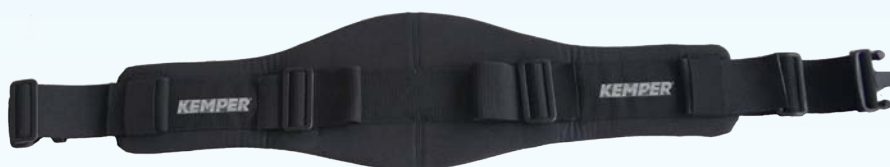
Heavy duty belt