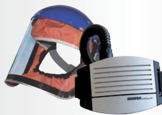
KEMPER autoflow XP® with protection hood