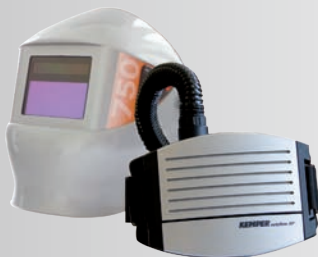
KEMPER autoflow XP® with autodark® 750